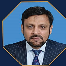
Syed Ghulam Abbas Kazmi Chief Commissioner RTO Islamabad