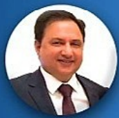
Jam Ikramullah Dharejo

Sindh Minister for Industries & Commerce Government of Sindh