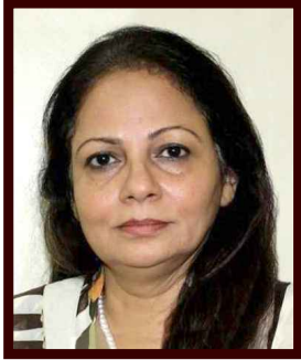
Dr. Ayesha Ghaus Pasha Minister for Finance Government of Punjab